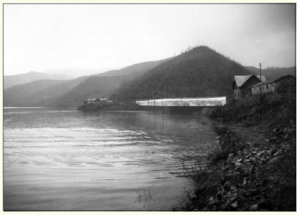
Fig. 3 – The reservoir and Secondary Dam of Sella Zerbino (photo from the mid-1920s)