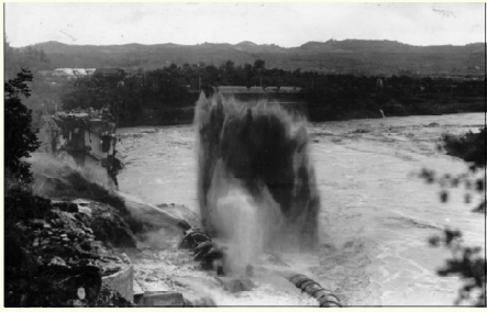
Fig. 5 – Destruction of the hydroelectric plant during the emptying of the penstock (August 1935)