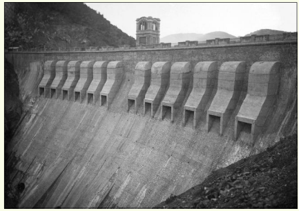
Fig. 2 – The Main Dam of Bric Zerbino showing the twelve dam siphons (O.E.G. photo, 1925)