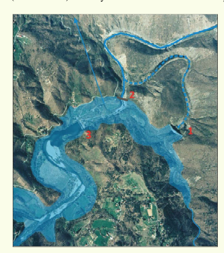
Fig. 4 – View of the maximum impoundment with the position of the two dams (1 and 2) and the check dam of Ortiglieto (3) on the Torrent Orba

The criminal trial held by the Turin Courts in 1938 returned a verdict of acquittal for the managers of the O.E.G. and the designer of the plant. There were multiple causes which led to the disaster and which can be mainly ascribed to the lack of geological investigations within the hydroelectric plant area. In addition, thorough hydrological and hydraulic studies were not carried out, which could have accurately tested the adequacy of the dam's discharge system. Finally, the original project was changed several times in order to reduce building costs and increase the volume of water stored without ever considering the proper safety of the plant. The Orba Valley disaster occurred 12 years after the Gleno disaster (356 lives lost) and 28 years before the Vaiont catastrophe (1917 lives lost).