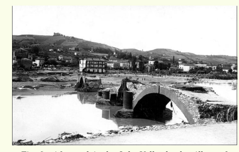
Fig. 6 – Aftermath in the Orba Valley by the village of Ovada (August 1935)