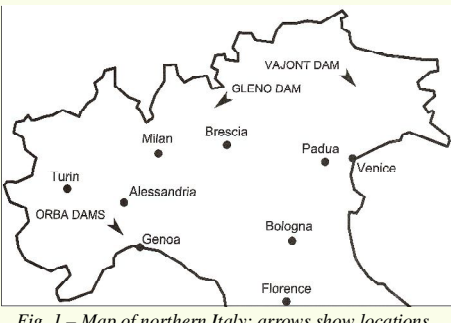
Fig. 1 – Map of northern Italy: arrows show locations of Orba, Gleno and Vaiont dams

This achievement, though, posed a serious problem: at one point of the perimeter of the planned impoundment, some 300 m west of the Main Dam, a saddle formed by two ridges would have been at a lower elevation with respect to the maximum storage level. As a consequence, water could have overflowed the saddle and poured out into the underlying riverbed. Therefore, it was held necessary to construct a secondary barrage, made up of a 110 m long and 14 m high summit wall. This barrage was planned and built rather hastily, without the support of adequate geological investigations since, according to the planners, this saddle "was made up of sound rock". The second dam, named Secondary Dam of Sella Zerbino (Fig. 3), was a massive wall of Portland cement on top of which ran the road leading to the adjacent Main Dam. The reservoir resulting from the two barrages stretched upstream for some 5 km with an irregular shape and a maximum width of some 400 m (Fig. 4). The hydroelectric plant fed by this reservoir was built 3 km downstream of the two dams.